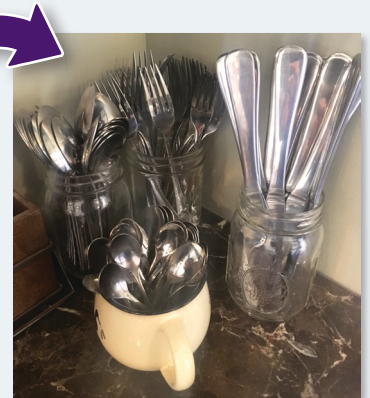
AFTER: Silverware at self-serve station

ReThink Disposable is a program of Clean Water Action and Clean Water Fund conducted in partnership with local businesses and government agencies. Generous support is provided by a changing list of public and private funders. To learn more about the program, its partners, and funders, visit: www.rethinkdisposable.org .