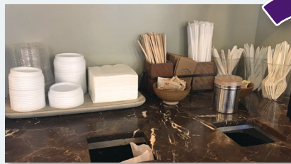
BEFORE: Disposables at self-serve station.